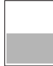
Half page, horizontal 8" x 5"